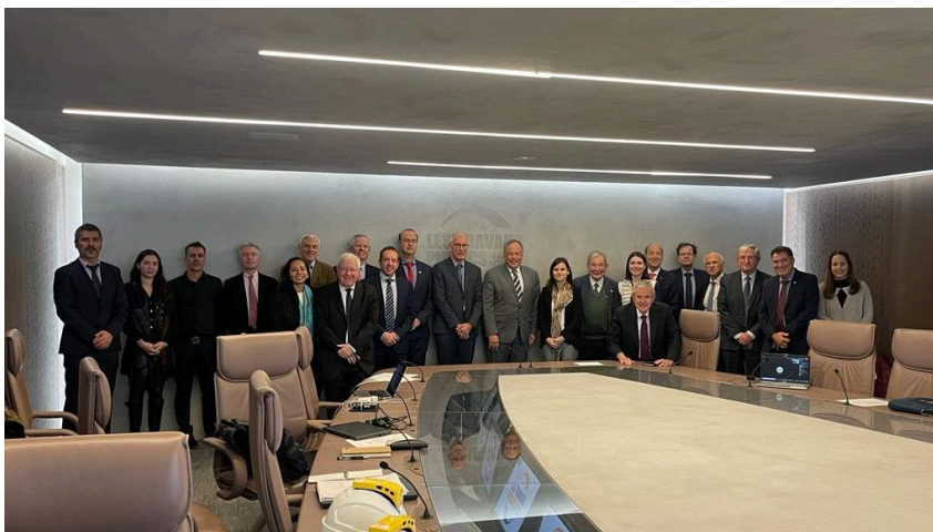
Family picture at CICA Board and General Assembly.