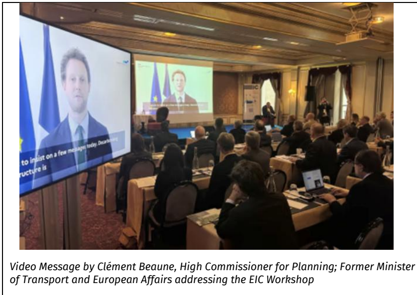
Video Message by Clément Beaune, High Commissioner for Planning; Former Minister of Transport and European Affairs addressing the EIC Workshop

The EIC Workshop on 25 th April 2025 , held during the EIC Spring Conference in Bordeaux, attracted more than 100 delegates for a vivid discussion around Decarbonisation of Infrastructure Construction (From Concept to Reality). The Workshop explored the policy and industry aspects of decarbonisation in infrastructure construction, as developed and implemented by the key stakeholders, i.e. regulators, financiers, contracting authorities, contractors and suppliers.