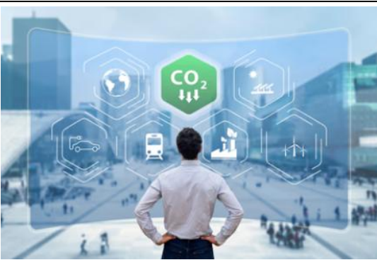
Towards Climate-Smart Procurement: EIC, FIEC and EuDA launched a tender for a Comparative Study on CO 2 Emission Methodologies in European Public Works Tenders.

Following the launch of a Manifesto on Achieving Carbon and Resource Neutrality in the European construction sector, published in December 2023, EIC teamed up with FIEC and the European Dredging Association (EuDA) in April 2025 to launch a tender for a comparative study on CO 2 emission methodologies applied in public tenders in Europe. The objective of such study is to inform EU Institutions, EU Member States and Multilateral Development Banks about existing methodologies to quantify and calculate CO 2 emissions in public tenders in Europe and to make bidders' capacity to reduce such emissions an award criterion. To achieve this goal, the requested Comparative Study shall map the different methodologies used within Europe and identify best practices as well as specific recommendations for helping public authorities to develop the most adequate methodology to measure and evaluate CO 2 e emission reductions in public works tenders.