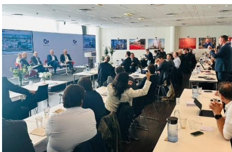
European international contractors contribute to the discussions at the EIC Autumn Conference in Copenhagen, October 2024

The EIC Workshop on 4 th October 2024 , held during EIC Autumn Conference in Copenhagen, attracted more than 80 delegates for a discussion on how Collaborative Delivery Models (CDM) can facilitate large and complex construction projects to ensure that these are on time, in budget and with the envisioned benefits. Concrete case studies with first-hand experience of implementing CDMs, as well the policy, legal and consulting framework were discussed.