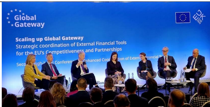
Opening Panel during 2 nd High-Level Conference on Enhanced Coordination of External Financial Tools on 01 st October 2025 in Brussels.

EIC was also invited to participate in the 2 nd High-Level Conference on Enhanced Coordination of External Financial Tools , co-organised by the European Commission and the Danish EU Council Presidency on 1 st October 2025. From the conclusions of this conference, it appears that Europe is eventually tackling its long-standing ‘silo mentality’. There is now a momentum for strategies that have been advocated by EIC for a decade, such as the definition of an EU ‘Whole-of-Government Approach’ through a closer collaboration between Team Europe members and EU export credit agencies (ECAs).